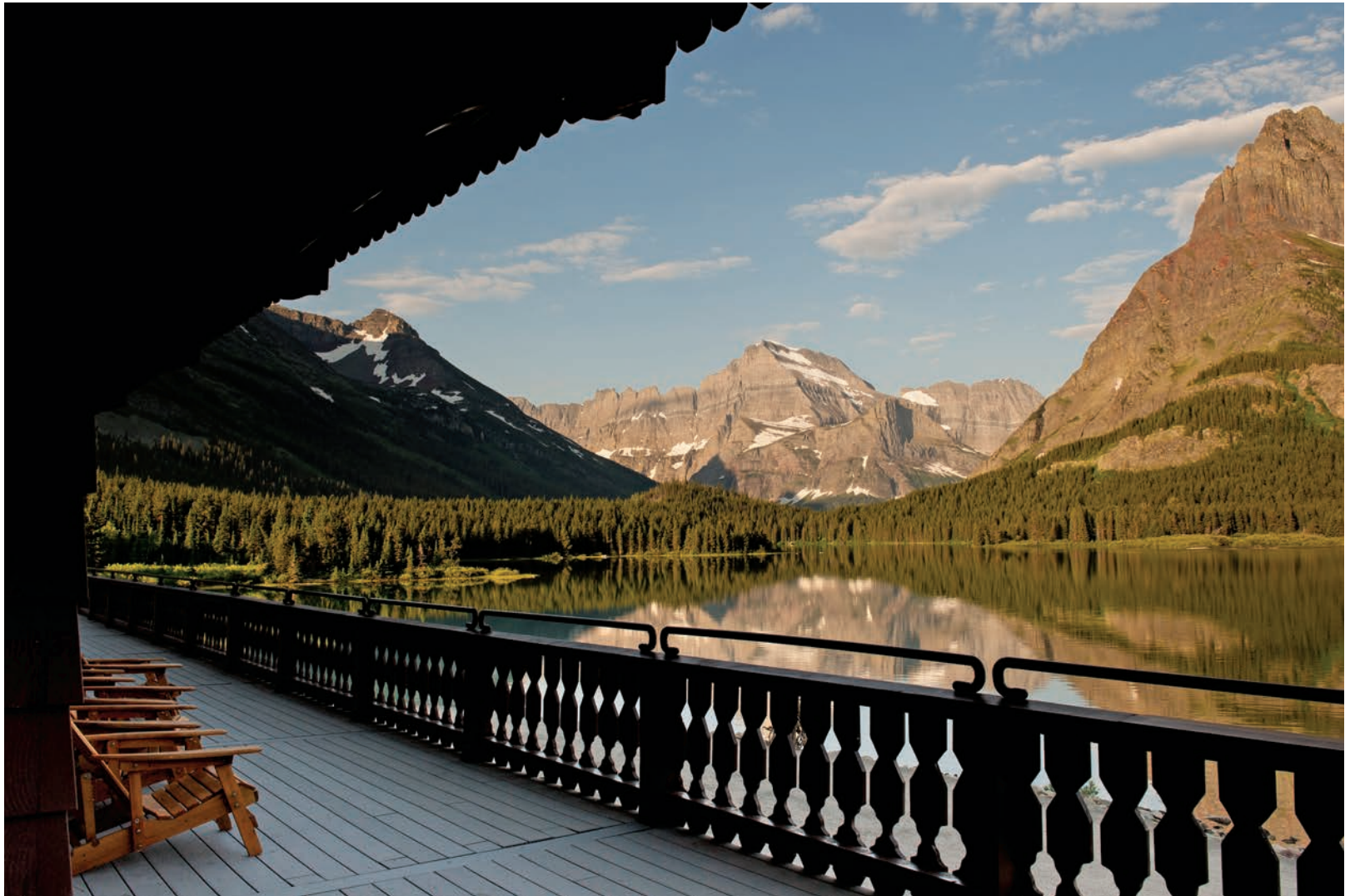
Unwind on a lakeside deck at the historic Many Glacier Hotel, the largest lodge in Glacier National Park.

CROWN OF THE CONTINENT On your second Glacier day, drive the epic Going-to-the-Sun Road (partially closed mid-September through early June) through the heart of the park and over 6,646-foot Logan Pass. Eat & Stay: St. Mary Lodge and Snowgoose Grille , St. Mary.