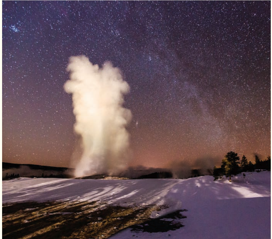
Top: Witness the wonder of Old Faithful during an evening visit to Yellowstone National Park. Bottom: Go kayaking on Bowman Lake, Glacier National Park. Far left: See daredevil stunts at Evel Knievel Days in Butte. Left: Cheer on the cowboy skiers at the Whitefish Winter Carnival's signature skijoring event.