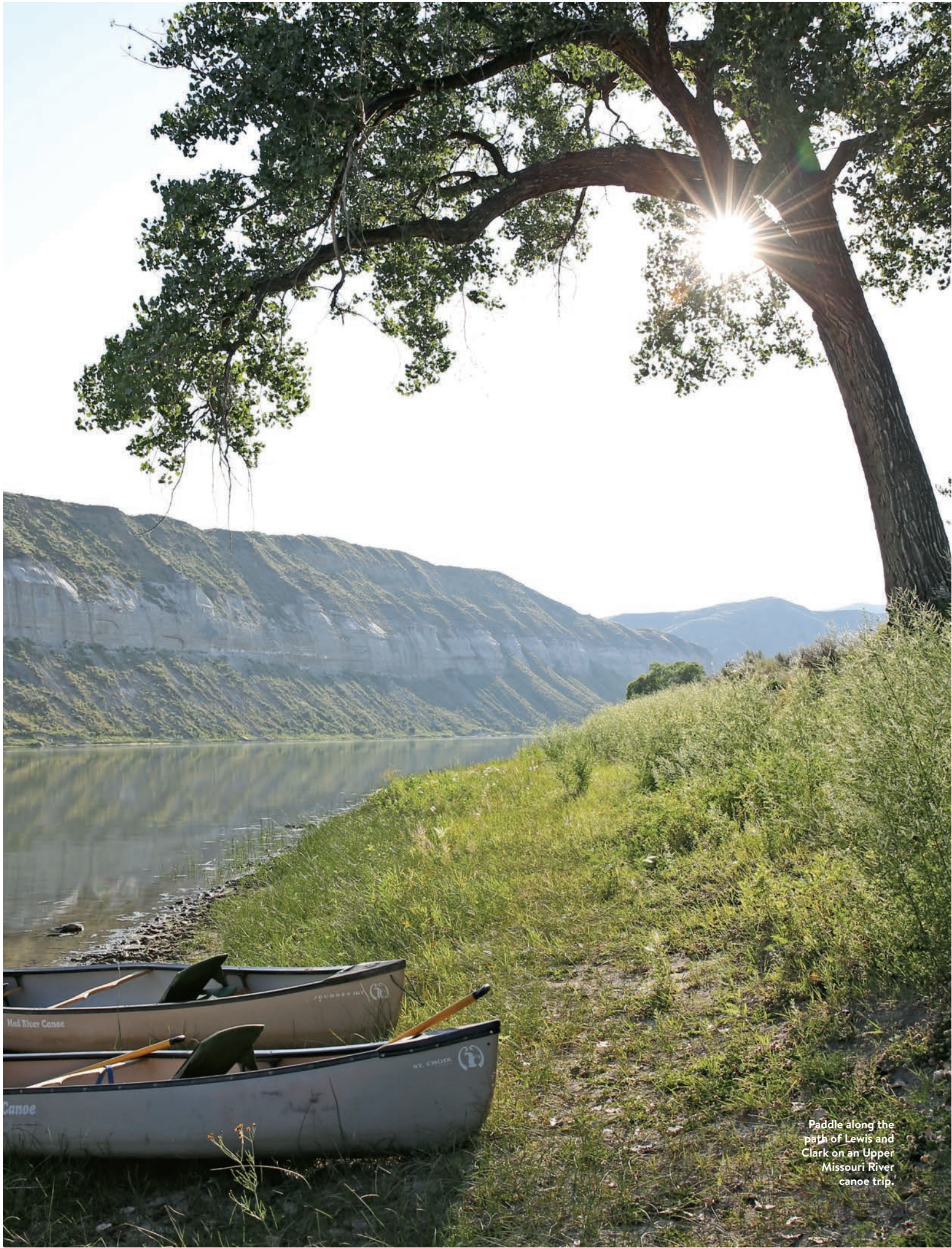
Paddle along the path of Lewis and Clark on an Upper Missouri River canoe trip.