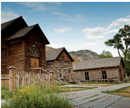
Left to right: Explore Bannack State Park ghost town. Munch a burger at Square Butte Bar & Country Club. Bike in Gallatin National Forest.

TAKE A HIKE There’s so much to see in Glacier National Park that you’ll need to spend at least two days there. Begin by hiking the Highline Trail (for alpine views and possible wildlife sightings) or the Iceberg Lake Trail , which leads to a teal-blue lake holding small icebergs most of the summer. Eat & Stay: Base Camp Café , Columbia Falls, and Belton Chalet , West Glacier.