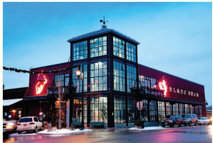
Above clockwise: Enjoy flatbread and fresh air at the Emerson Grill, Bozeman. See what’s on tap at the Great Northern Brewing Company, Whitefish. Save room for a lemon-blueberry tart at Kafe Utza, Miles City. Right: Experience the farm-to-table movement in Montana.