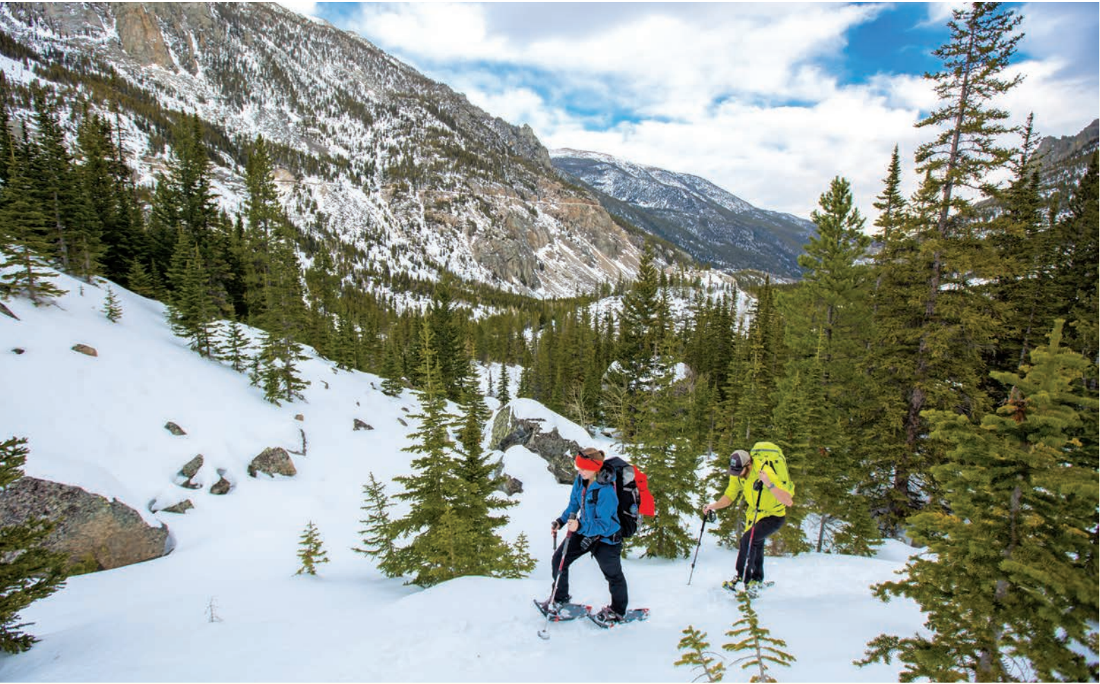
Above: Strap on a pair of snowshoes and head out on the Mystic Lake Trail near the tiny community of Nye to access Montana's amazing backcountry. Below: A few miles from the town of West Yellowstone is the fabled Two Top Mountain with sweeping views of Yellowstone National Park.