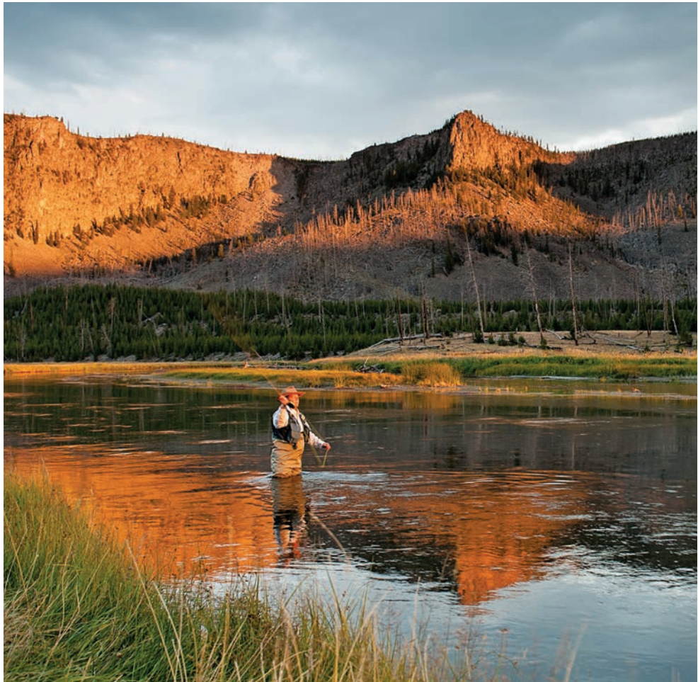
Above: Go fly-fishing on the Madison River. Below: Ride the Charlie Russell Chew Choo to see the wide-open spaces that inspired his famous Western art. Top left: See wildlife up close at the Grizzly and Wolf Discovery Center in West Yellowstone. Bottom left: Enjoy top-of-the-world views from Beartooth Pass.

DINOSAURS & DETOURS Play paleontologist at the Great Plains Dinosaur Museum and Phillips County Museum in Malta. Take a side trip to either Bowdoin National Wildlife Refuge (follow Old U.S. 2 east) or Sleeping Buffalo Hot Springs Resort (via U.S. 2