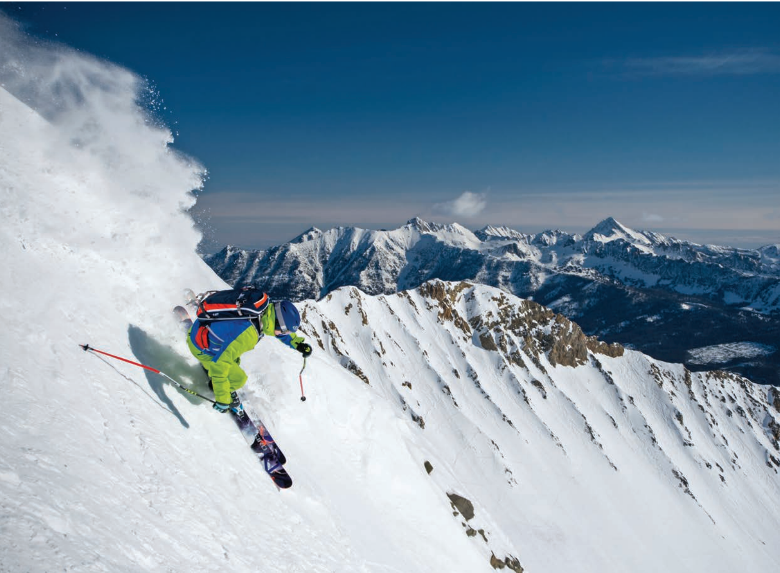
Above: Conquer expert and extreme terrain on Lone Peak at Big Sky Resort. Right: Watch the wild rodeo action at Miles City's Bucking Horse Sale.