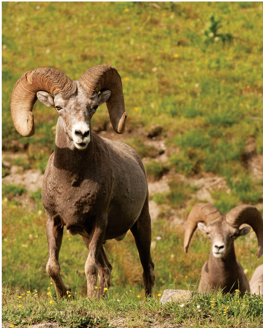
Above: Look for bighorn sheep near Logan Pass in Glacier National Park. Top left: Learn about Blackfeet culture at the Blackfeet Indian Reservation. Bottom left: Paddleboard on Flathead Lake, the largest freshwater lake west of the Mississippi River.

MOUNTAIN MAJESTY Southeast of Great Falls, hop on the Kings Hill Scenic Byway . The 71-mile drive crosses the highest pass in Montana that's open all year and runs through the Lewis and Clark National Forest . See the Big Belt Mountains to the west and the Castle Mountains to the east, and stop to