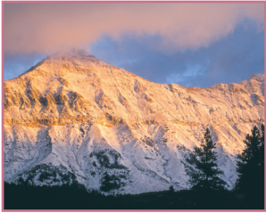
Marias Pass area, Glacier National Park

Your first stop is Browning. The exhibits of cultural artifacts at the Museum of the Plains Indian are among the finest in the West. The Blackfeet Heritage Center and Art Gallery and the Lodgepole Gallery and Tipi Village feature traditional and contemporary arts and crafts. If you visit during the second week in July, don't miss the dancing, drumming, rodeo action and teepees at North American Indian Days.