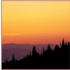
View from Whitefish Mountain Resort on Big Mountain

This driving tour accompanies the Crown of the Continent MapGuide. Log on to visitmt.com/national_parks/glacier for your MapGuide.