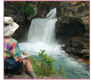
St. Mary Falls, Glacier National Park

West Glacier Village (406) 888-5662 • westglacier.com