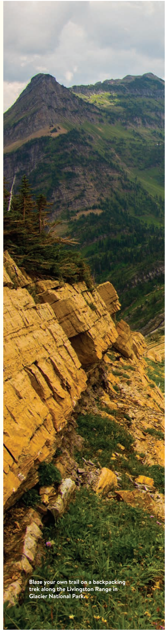
Blaze your own trail on a backpacking trek along the Livingston Range in Glacier National Park.

M ontana has more than 50 state parks offering fun and family-friendly activities. Whatever you want to do, there's a park out here for you. Hike, bike, picnic, paddle, pitch a tent, or discover a chapter of Montana history. At Makoshika State Park in Glendive, ramble through the badlands to see fossilized remains of Tyrannosaurus rex , Triceratops , and other dinosaurs. Travel back in time at Bannack State Park , home to a non-commercialized ghost town dating from the gold rush era. In the Flathead Lake area, there are several state parks to choose from including off-the-beaten-path Lake Mary Ronan State Park , known for its terrific fishing and crystal clear waters. At West Shore State Park , stand on the rock outcrops carved by glaciers to savor spectacular views of Flathead Lake and the Mission Mountains and Swan Range.