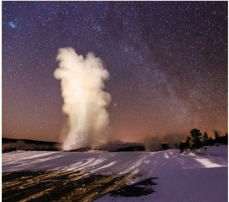
Top: Witness the wonder of Old Faithful during an evening visit to Yellowstone National Park. Bottom: Go kayaking on Bowman Lake, Glacier National Park. Far left: See daredevil stunts at Evel Knievel Days in Butte. Left: Cheer on the cowboy skiers at the Whitefish Winter Carnival's signature skijoring event.

An encyclopedic, user-friendly resource for trip ideas and general wanderlust. Here, you'll find a wealth of varied information—motorcycle route ideas, a compilation of powwows, craft breweries, wineries, ghost town rundowns, and just about anything else you can think of. VISITMT.COM