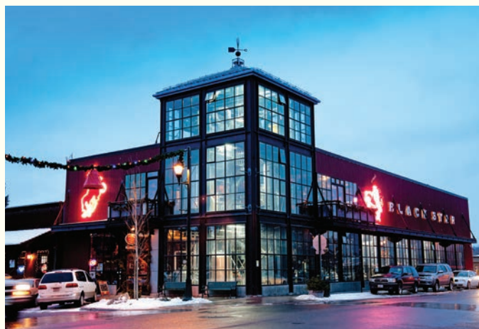
Above clockwise: Enjoy flatbread and fresh air at the Emerson Grill, Bozeman. See what's on tap at the Great Northern Brewing Company, Whitefish. Save room for a lemon-blueberry tart at Kafe Utza, Miles City. Right: Experience the farm-to-table movement in Montana.